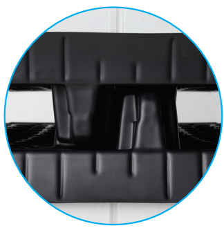
Interlocking Pallet Legs