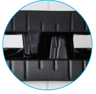
Interlocking Pallet Legs