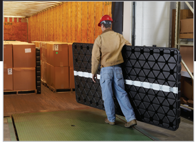
Ergonomic hand hole design makes parts easy to carry