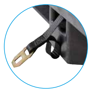
1" Webbing/ 59" Min. Length Easy Grip Loops