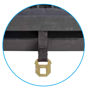
Locations Available in Length and/or Width