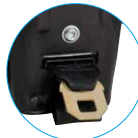
2" Webbing/ 59" Min. Length Easy Grip Loops

Locations Available in Length and/or Width