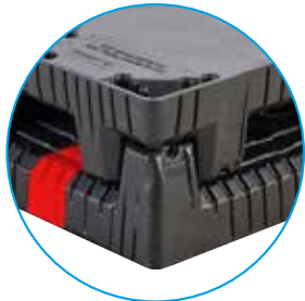
Mirror Image Design