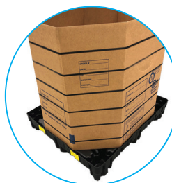
Secure Combo Hold