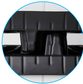
Interlocking Pallet Legs