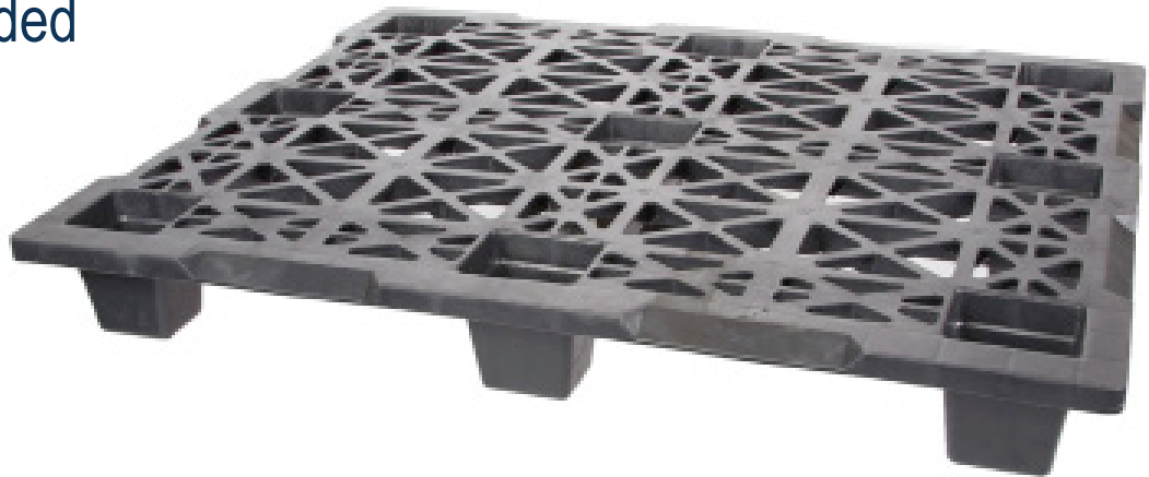
TOP VIEW NESTABLE PALLET