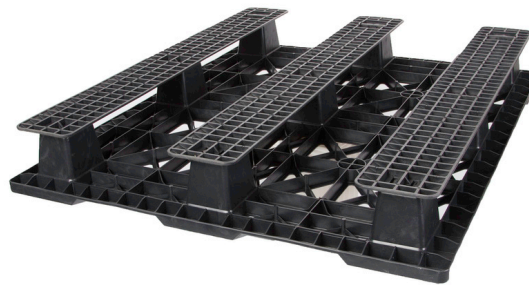
BOTTOM VIEW WITH RUNNERS