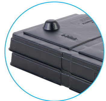
Nestable Conveyable Cover Design