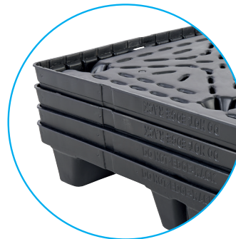
Nestable Conveyable Pallet Design