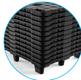
Nests with similar models