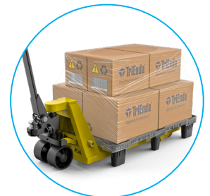
30" Deck fits in narrow spaces