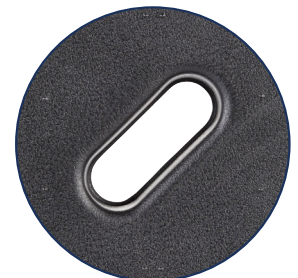
Ergonomic Hand Holes