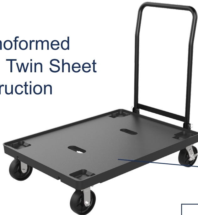
TruGrip ™ SURFACE