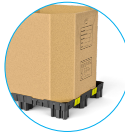
Secure Combo Hold