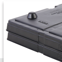
Nestable Conveyable Cover