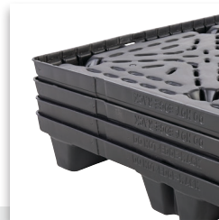
Nestable Conveyable Pallet