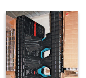
Durable design for rail shipments