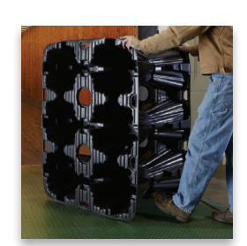
Slides Easily Into Place