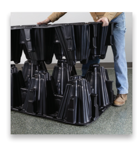
Patented Interlocking System