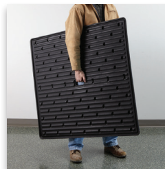
Ergonomic hand holes