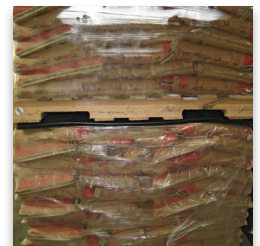
Stabilize double and triple stacked loads