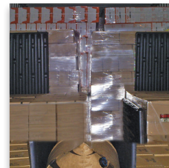
Prevents toppling of freight