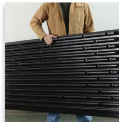
Ergonomic hand holes