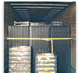
Can be combined with strapping