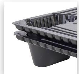
Nestable Pallet Design