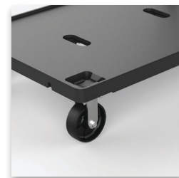
Premium locking wheels

Introducing TruGrip™ offering the highest COF available on the market using a proprietary rubber-like material. Prevents slippage of boxes on fork tines and on floors.