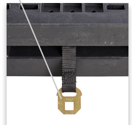
Locations Available in Length and or Width