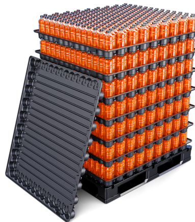
Plastic/Aluminum Bottle Trays + GS4840 Pallet