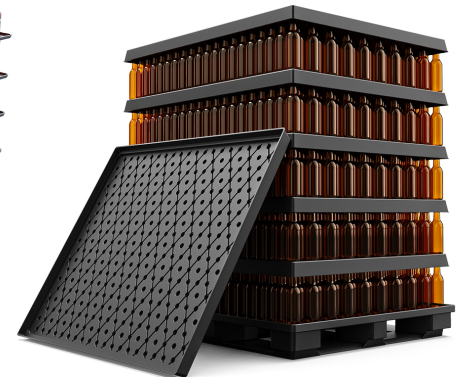
Glass Bottle Trays + GS4840 Pallet