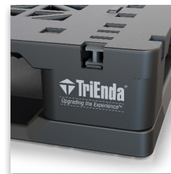
Reinforcement Rods and Ink Stamping