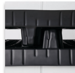
Interlocking Pallet Legs