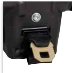
2" Webbing/ 59" Min. Length Easy Grip Loops Locations Available in Length and/or Width