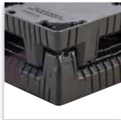
Mirror Image Design