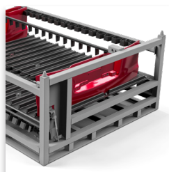
Turn Key Solutions - integrating steel and thermoformed dunnage