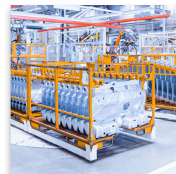
Variety of Painted Finishes