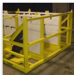
Complex Steel Racks with various forms of dunnage