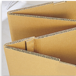
Paper Corrugated Sleeve