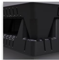
Interlocking Pallet / Lid Legs